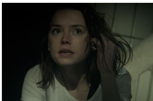
“Blue Season” starring Daisy Ridley of “Star Wars: Episode VII The Force Awakens”