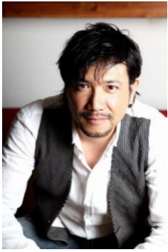
SSFF & ASIA Founder, Tetsuya Bessho

The festival was begun by actor Tetsuya Bessho, a native of Japan and SAG member.