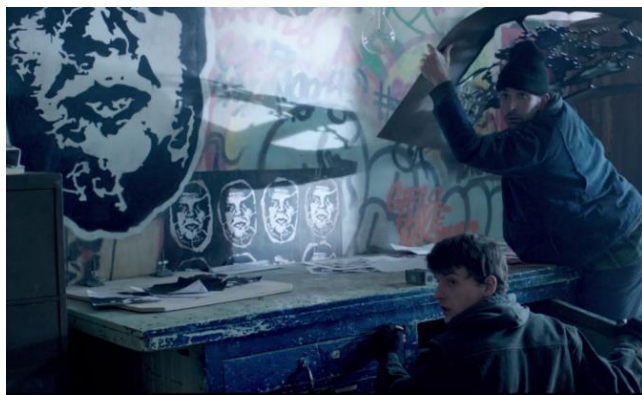
"OBEY THE GIANT - The Shepard Fairey Story"