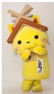
Shimanekko (Shimane Prefecture)

A lineup of Japan tourism videos from the comprehensive travel website "Tabimoja" (Tabi Motion Japon) that will leave you itching to travel! Enjoy this special event with local mascot characters from throughout Japan in attendance. You may just encounter a Japan that you never knew existed!