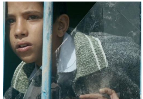
SSFF &amp; ASIA 2015 Grand Prix winner