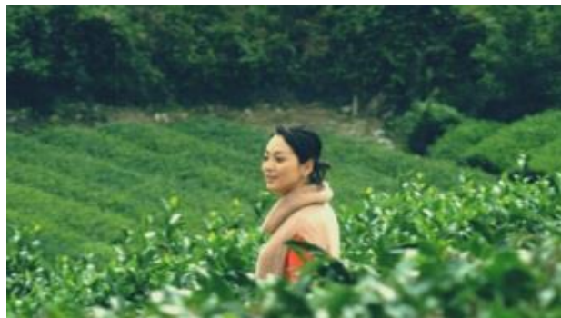
"Another Kyoto" film still