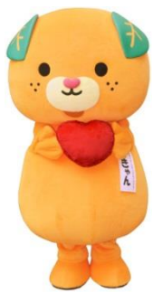
Mican (Ehime Prefecture)