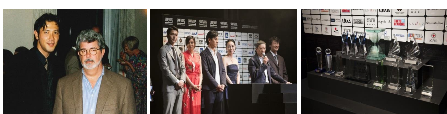
(From Left to Right) 1999: SSFF & ASIA Festival President meets Director George Lucas at a party held at the Embassy of the United States. 2015: AWARD Ceremony.

The short film specialist theater Brillia Short Shorts Theater was established in the Minatomirai area of Yokohama in 2008. Whilst providing one of the festival’s annual venues, the theater has welcomed over 320,000 audience members to date. As the festival expands its activities in Japan, spreading the word of short film, it will also continue to support young creators and provide a springboard into the film industry.