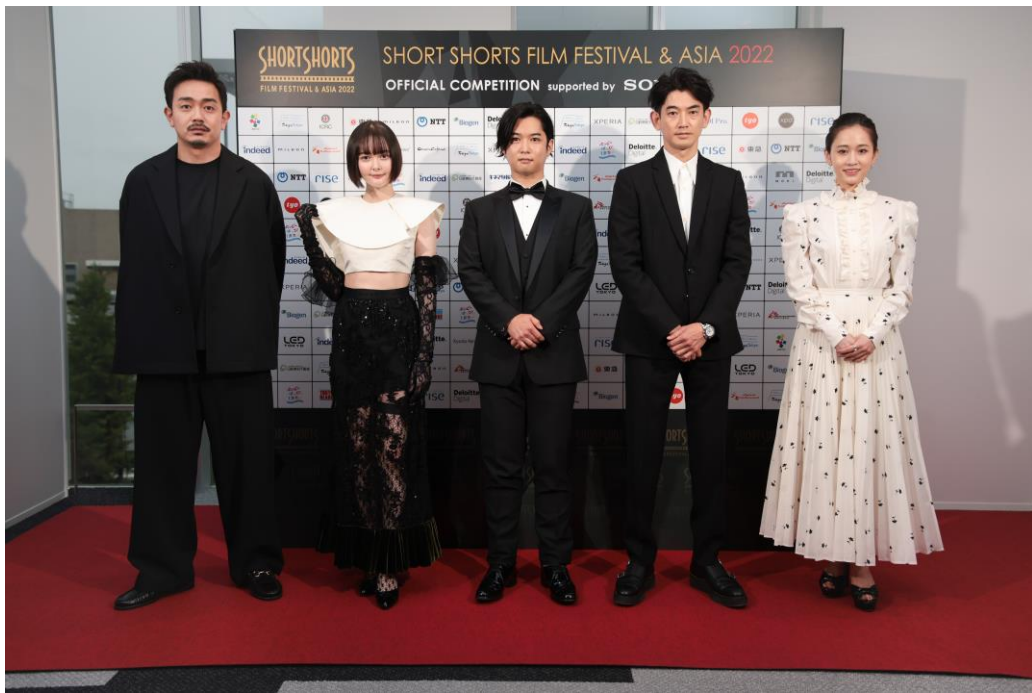
from left: Sho Aoyagi, Tina Tamashiro, Yudai Chiba, Eita Nagayama, Atsuko Maeda

In honor of Actors Short Film 2, a program for actor to challenge themselves as directors, the nominees for the Japan Program, Sho Aoyagi, Tina Tamashiro, Yudai Chiba, Eita Nagayama, and Atsuko Maeda came and spoke at the Opening Ceremony about their process of directing.