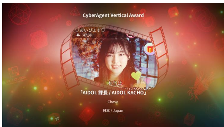
CyberAgent Vertical Award Winner: "AIDOL KACHO"