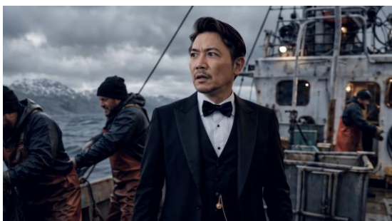
CINEMA TRAVELER 2 (C) Dir: Hiroki Yamaguchi (GAUMAPIX)